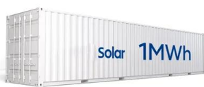
Standard 40ft containers